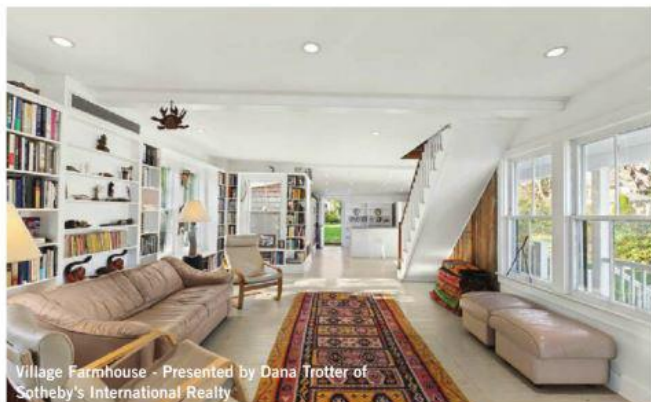
Village Farmhouse - Presented by Dana Trotter of Sotheby's International Realty