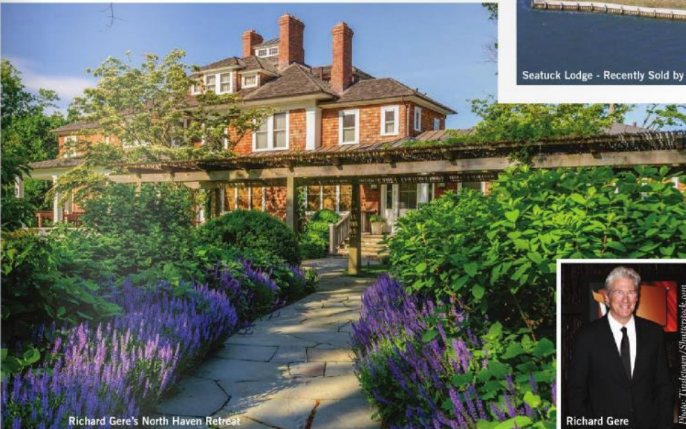
Richard Gere's North Haven Retreat