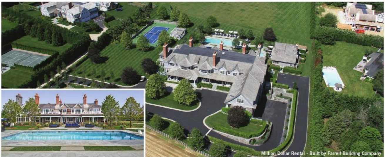
Million Dollar Rental - Built by Farrell Building Company