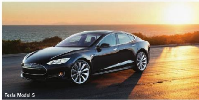
Tesla Model S

million. With its own movie theater it might attract a Hollywood type. Then there's the walk-in fridge, perfect for a celebrity chef. Or maybe the basketball court will attract a high-profile Knick . And if they can't afford the price, they can kick in a mere $500,000 for a shorter term. Listed by Gary DePersia of Corcoran .