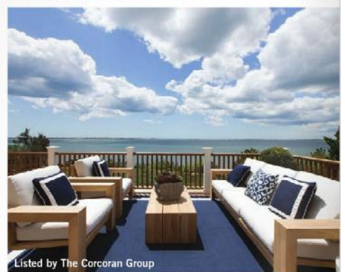
Listed by The Corcoran Group