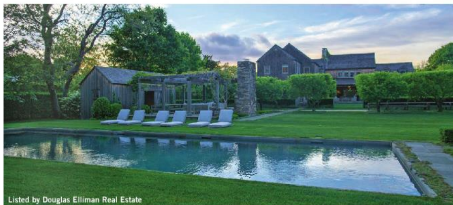
Listed by Douglas Elliman Real Estate