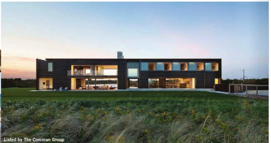
Listed by The Corcoran Group