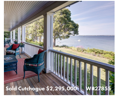
Sold Cutchogue $2,295,000 W#27855