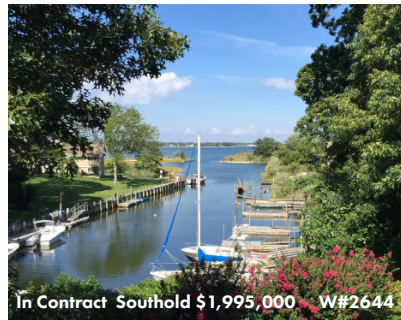
In Contract Southold $1,995,000 W#2644