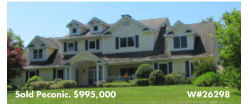
Sold Peconic. $995,000 W#26298