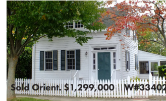
Sold Orient. $1,299,000 W#33402