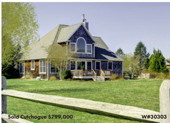
Sold Cutchogue $799,000 W#30303