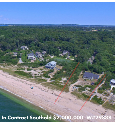
In Contract Southold $2,000,000 W#29838

In the past few months we have LISTED and SOLD these properties, along with dozens of others. Call a Town & Country Associate for success in selling your North Fork property.