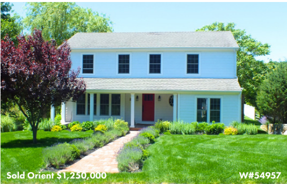
Sold Orient $1,250,000 W#54957