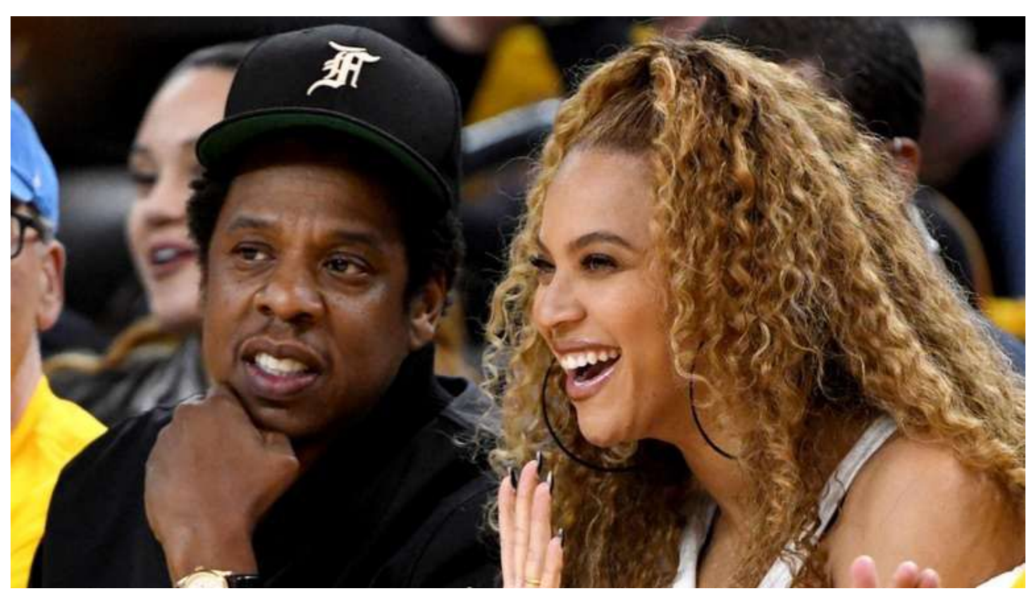
Jay-Z and Beyoncé were among several prominent bidders for the plot of land on Georgica Pond in East Hampton, which is next door to the $26 million home they bought in 2017.

"It will just be a passive property that we'll be managing with the town," says Quarty.