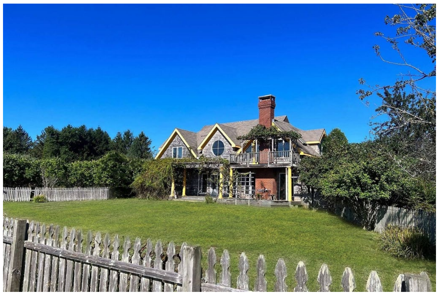
The Long Island home is 2,900 square feet. Town & Country Real Estate

The landscaping includes a pond, fruit trees, perennials, herb and vegetable gardens and several outbuildings.