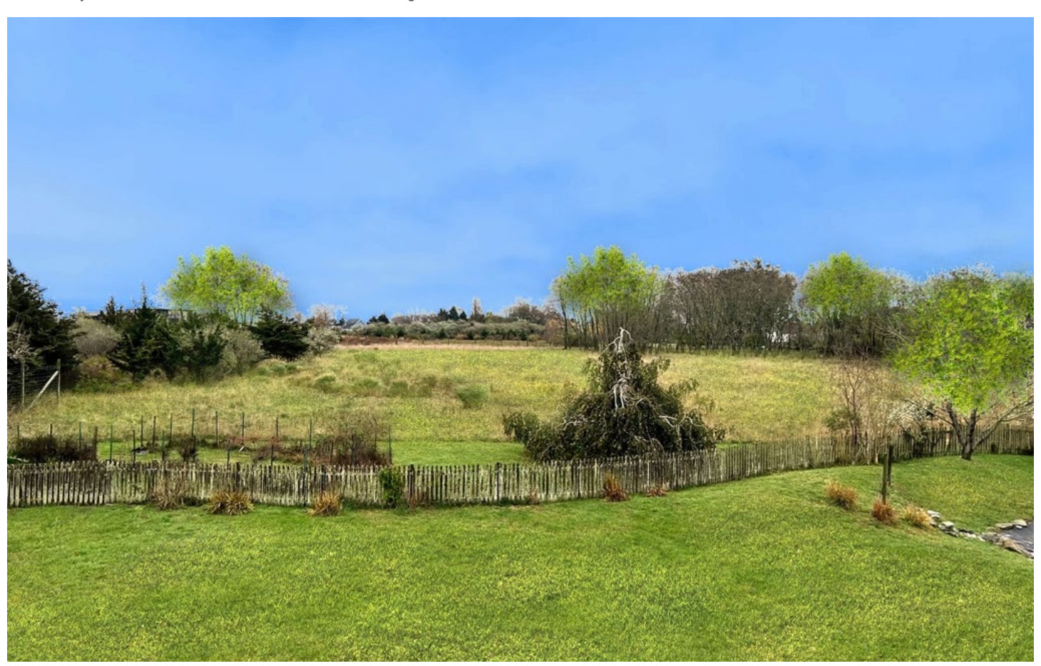
The estate's landscaping includes a pond, fruit trees, perennials along with herb and vegetable gardens. Town & Country Real Estate