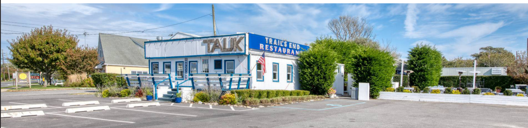
MONTAUK ICONIC RESTAURANT AND BAR web# 895310. EXCLUSIVE