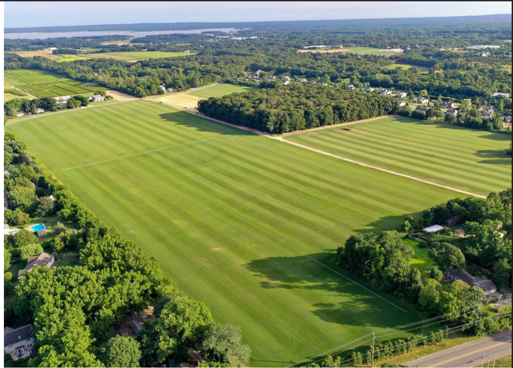
NORTH FORK AQUEBOGUE. web# 893729. EXCLUSIVE