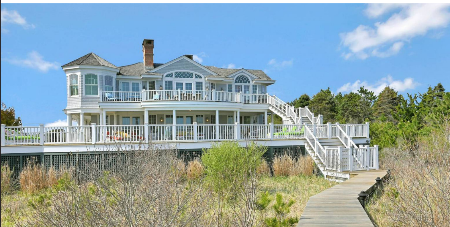
QUOGUE OCEANFRONT LUXURY web#878040. EXCLUSIVE

REAL ESTATE has, historically, been one of the best hedges against inflation. East End properties have proven to be an excellent, stable, long-term investments. Personally, my stockbrokers, financial advisors and accountants all convinced me to “diversify” with stocks, bonds, and securities. I went kicking and screaming years ago.