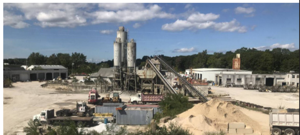
CALVERTON INDUSTRIAL web# 891369. EXCLUSIVE

Now , more than three decades later, they are all clients and my real estate investments in land, commercial & residential have secured my future. Having brokered real estate transaction through the ‘87 crash, 2000 NASDAQ crash, 2008/2009 fall of Bear Stearns & Lehman Bros, and several market rallies, I have countless clients who THANK me for advising them to buy vs. rent and invest in our North Fork and South Fork properties.