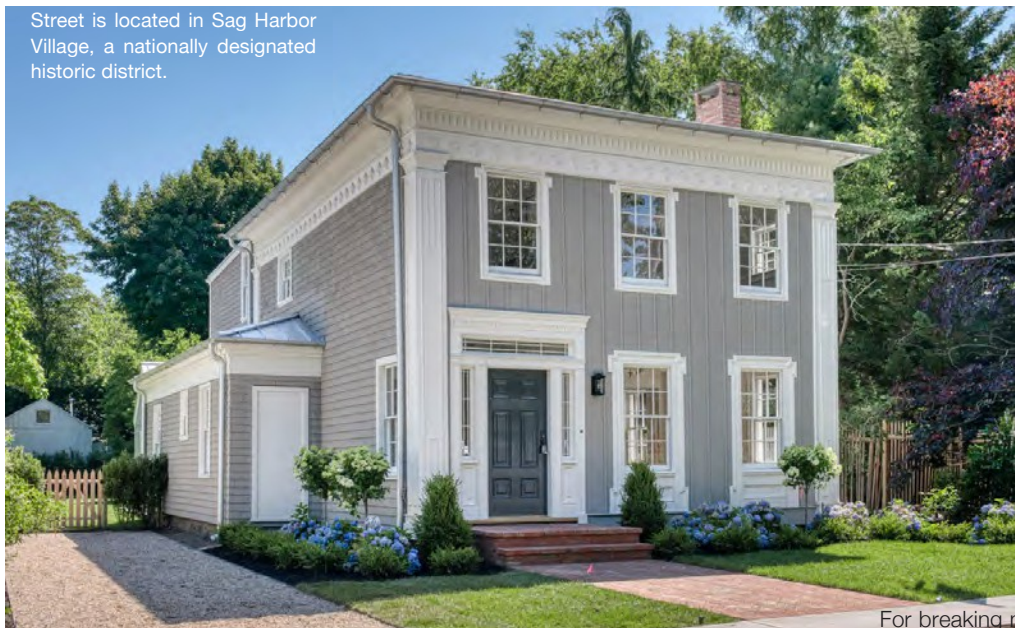
Street is located in Sag Harbor Village, a nationally designated historic district.

For breaking news and real estate coups, subscribe to dailyDeeds.com