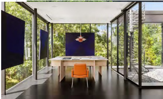
“SkyBox” Featuring panoramic views, 1052 Noyac Path in Water Mill was designed by firm 1100 Architect and is listed for $9.95 million.

beach access that was designed by architect Will Minnear. The eight-bedroom contemporary dwelling’s first-floor primary suite has its own poolside terrace, and additional suites open onto a grand terrace overlooking the beach. A 4,400-square-foot rooftop deck, outfitted with covered dining, bar and spa, offers jaw-dropping views of land and sea. Christopher Covert and Flora Veitch of the Modlin Group share the unique listing, which is asking $79.995 million. — Pamela Brill