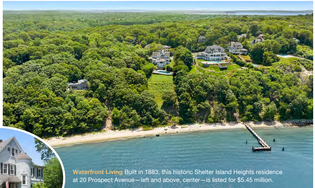
Waterfront Living Built in 1883, this historic Shelter Island Heights residence at 20 Prospect Avenue—left and above, center—is listed for $5.45 million.