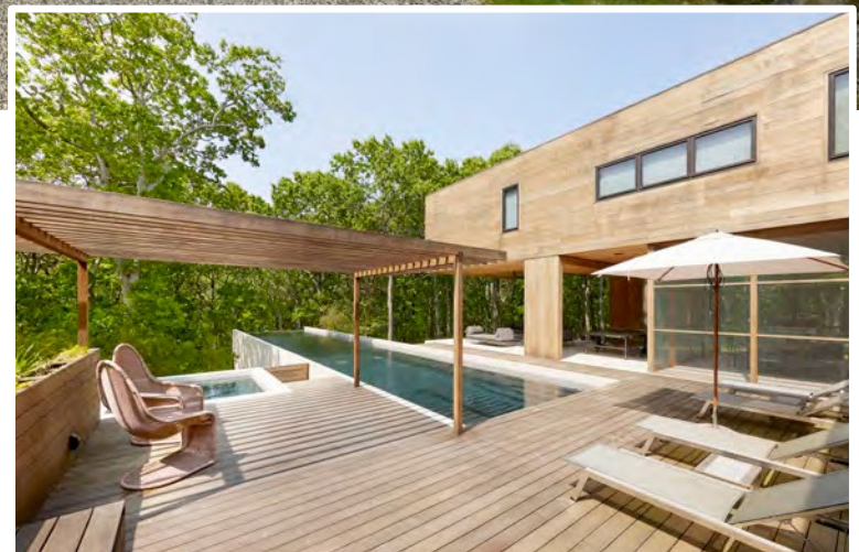
Fine Lines Southampton's 137 Great Hill Road, designed by Jasmit Singh Rangr, is listed for $8.5 million.

Sleek lines and high style abound on the East End, be it a glass showstopper that embraces natural light or a cabin-inspired oasis off the beaten path. No matter your specific aesthetic preferences, there are plenty of architectural gems on the market that are just calling out for a design-loving buyer. A contemporary Thoreau might find his own Walden Pond at 137 Great Hill Road in Southampton, where a modern-day cabin is set on six-plus acres of lush greenery. Designed by Jasmit Singh Rangr, the secluded six-bedroom home earned an Architizer A+ Award for its standout features, including a striking great room with a gas fireplace, and an outdoor entertaining area complete with a kitchen. The $8.5 million property, which also includes a tennis court and a gym, is listed with Bespoke Real Estate's Parallel Advisory Division. Waterfront living is taken to the next level at Shelter Island's 8 Little Ram Island Drive, where a James Merrell-designed dwelling sits alongside Coecles Harbor. The eight-bedroom manse has a private dock and mooring rights, rendering it a boater's paradise. An infinity pool and spa, with water views and bordered by manicured lawns, round out the scene of this $15.5 million oasis, listed by Nick Brown of Sotheby's International Realty.